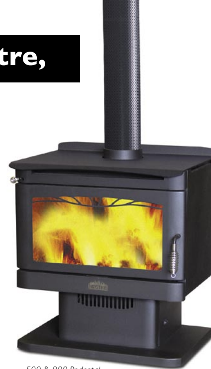
500 & 800 Pedestal