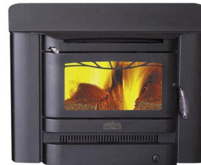
500 & 800 Inbuilt